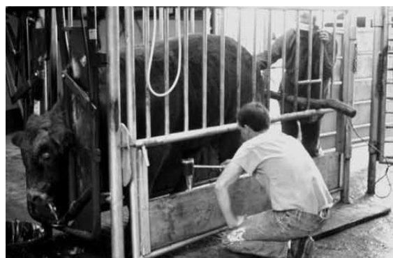
Electro-ejaculation is the most common method of collecting semen samples.

The two seminal characteristics that have shown to be the most reliable and repeatable in evaluating fertility under field conditions are initial spermatozoa motility (the vigor and number of cells moving in a linear progressive manner) and spermatozoa morphology (form and structure of individual sperm cells). Unfortunately, there can be a great deal of variation both within and between technicians in estimating sperm motility. Environmental factors can also have an effect on this estimate, and proper handling of the semen after collection is critical to a successful evaluation.